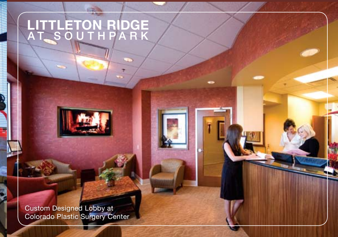
Custom Designed Lobby at Colorado Plastic Surgery Center