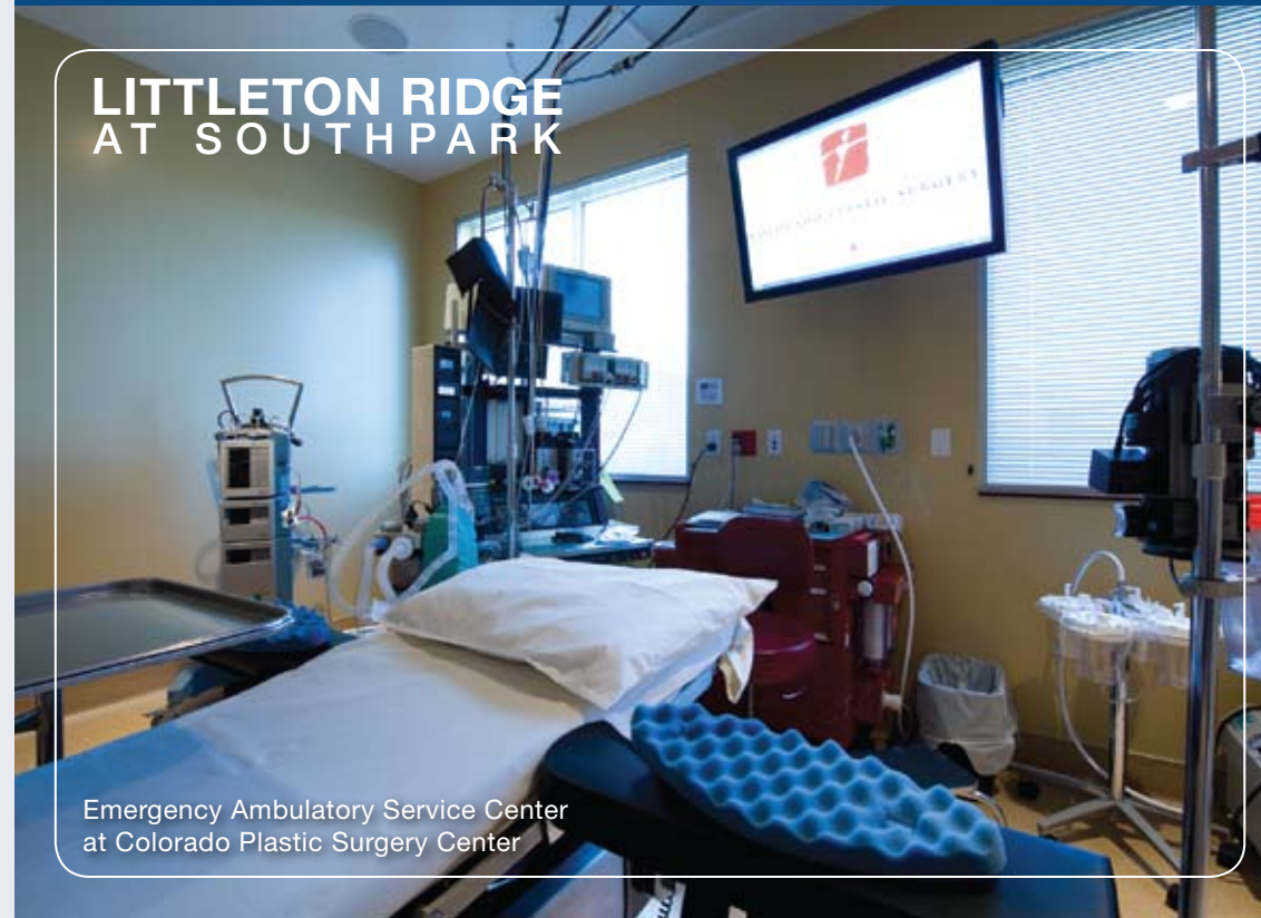
Emergency Ambulatory Service Center at Colorado Plastic Surgery Center